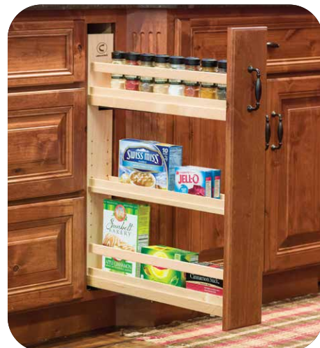
Pullout Spice Rack